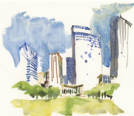
PUTTING IT TOGETHER with lost & found edges.