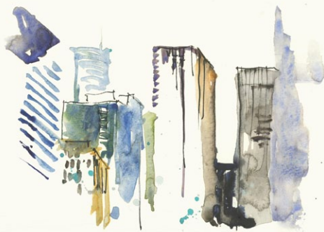
PUTTING IT TOGETHER with lost & found edges.