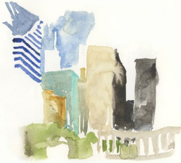
'PUSH' HUE &/OR CONTRAST